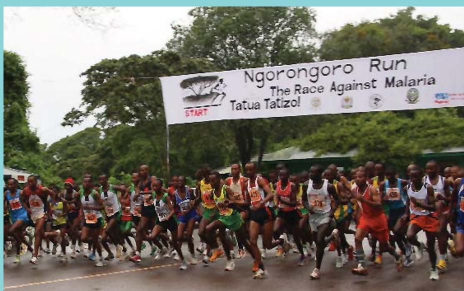
The Race Against Malaria